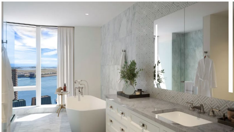
Floor-to-ceiling windows let in ample natural light and spectacular views.