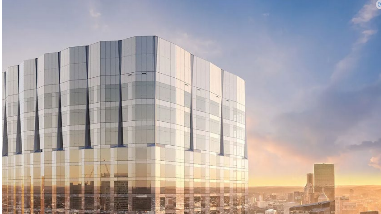
The penthouse sits on the 62nd floor of Winthrop Center, one of the newest additions to Boston’s skyline.