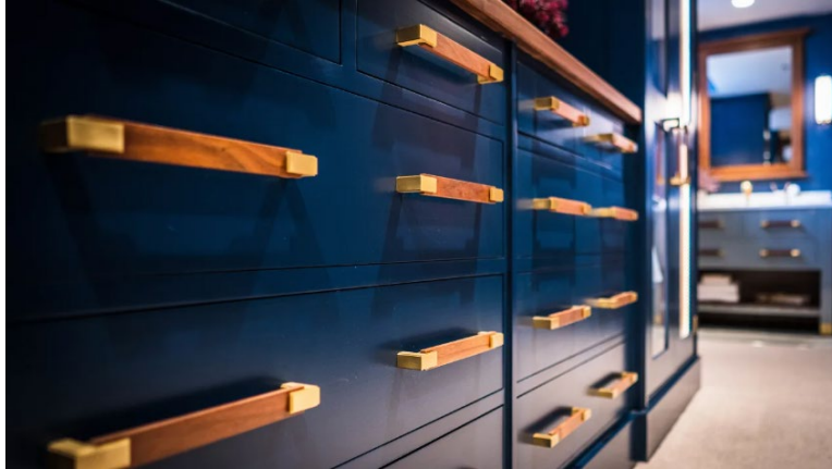
Eco-friendly materials were used throughout the unit.