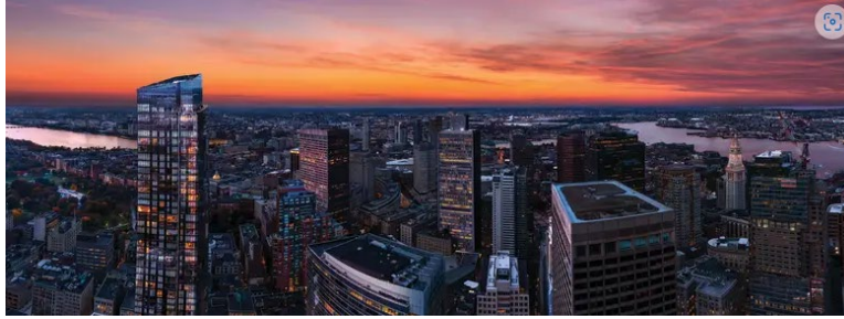
The penthouse offers panoramic views of the Charles River and Boston Harbor.