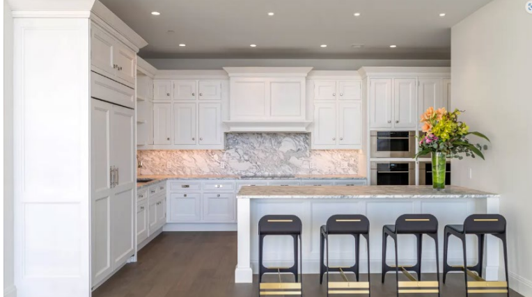
The professional grade kitchen showcases sustainable, state-of-the-art appliances.